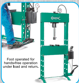
Foot operated for hands-free operation under load and return.