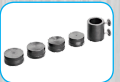
Bearing removal kit. (4 pieces, Ø64, 67, 72, 75)