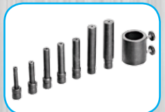
Press punches. (7 pieces, Ø12, 14, 16, 20, 22, 25, 30)